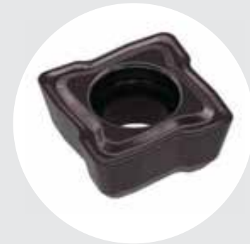
Top Cut 4